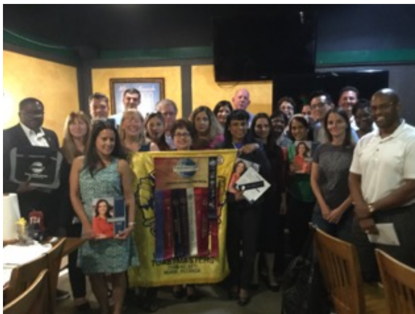
Photo taken in May 2018 West Kendall Toastmasters Club Members and Guests

KENDALL SPORTS GRILL 9090 SW 97TH AVENUE, MIAMI, FLORIDA - JUST OFF KENDALL DRIVE.