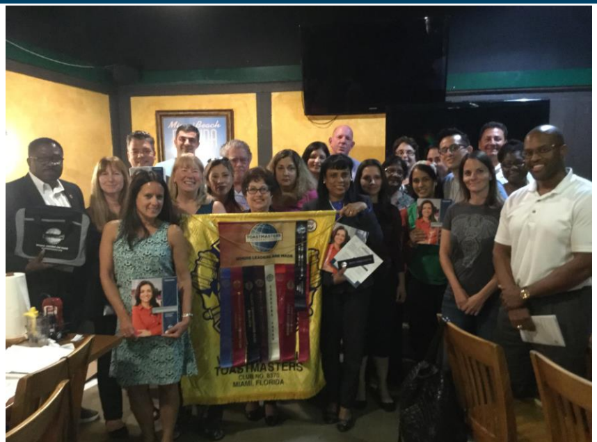
Photo taken in May, 2018 West Kendall Toastmasters Club Members and Guests

Kendall Sports Grill 9090 SW 97th Avenue, Miami, Florida - just off Kendall Drive.